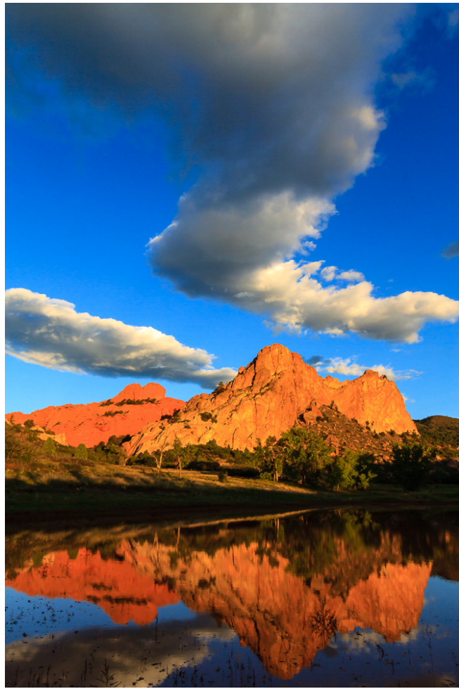
“Garden of the Gods Reflection” by Bruce du Fresne